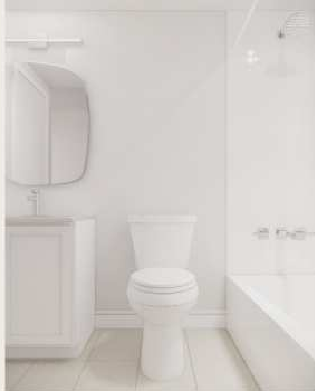
Bathrooms are complete with carefully chosen fixtures that include Hammerstone shower valves and top-quality bathtubs.