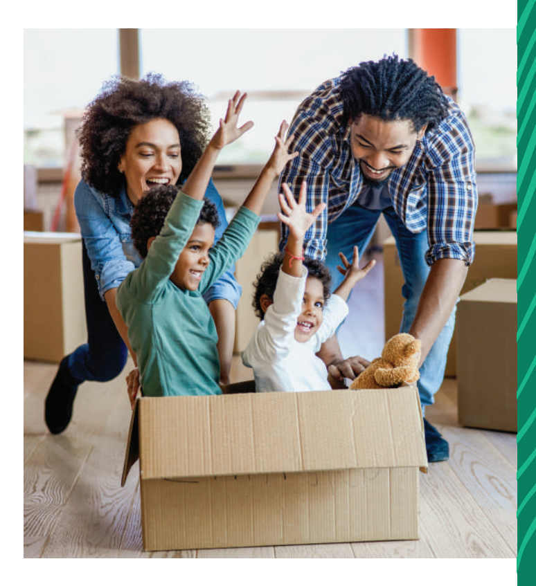
A home built around you.