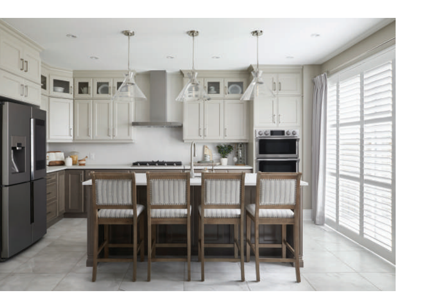
Choose from a mix of Townhomes and Detached Homes.

Choose from a variety of stylish Townhomes and Detached Homes, offering 1 to 2 car garages, roomy primary bedrooms and home offices to suit your needs.